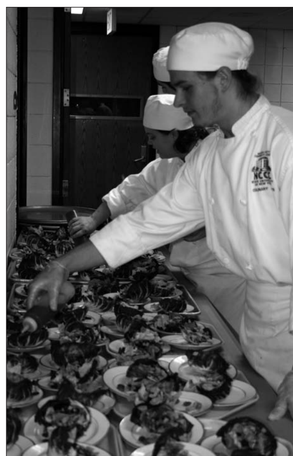
Culinary and pastry art students prep for an exquisite six-course meal at the 2008 Scholarship Gala.

The NCCC Foundation continues to celebrate the success of its alumni and promising prospects, awarding more than $2 million in scholarships over a course of 20 years. The Foundation Scholarship Gala is the largest scholarship fundraising event at NCCC. The projected date for the 2009 gala is October 17, at NCCC.